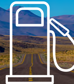
Infrastructure & Facilities