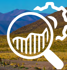
Research, Development, & Demonstration