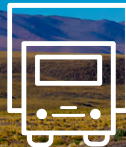
Vehicles & Equipment

Helping companies track, evaluate, and apply for 500+ US and Canadian programs that fund: